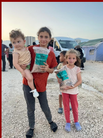
Families in Syria sincerely appreciate the blankets and food that came their way.

The board is pleased for the generous donations for the new storage building. We did it folks! We met our goal! Thank you supporters and donors!